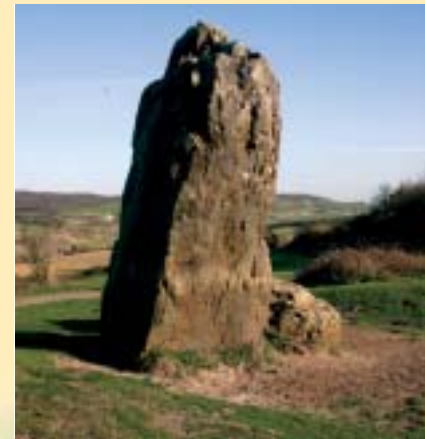
Mottistone Down Long Stone CA