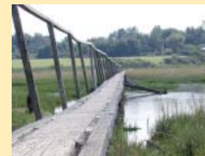
Wooden causeway at Newtown CA