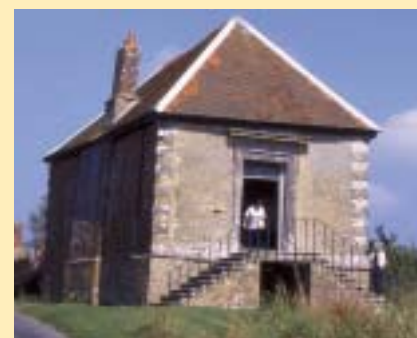
Newtown Town Hall CA