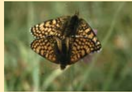
Gianville Fritillary butterflies IWNHAS