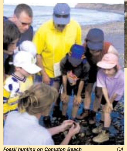
Fossil hunting on Compton Beach CA