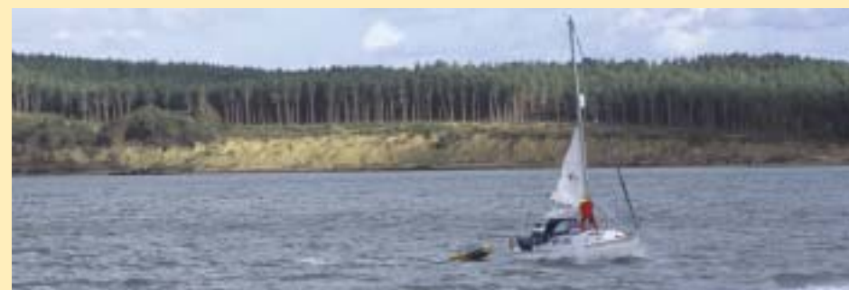
Bouldnor Cliffs CA