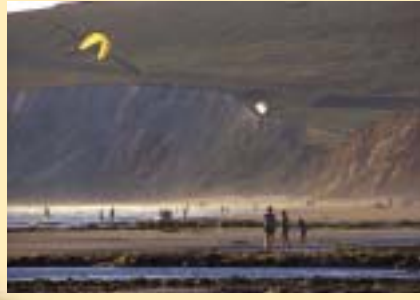
Compton Beach CA