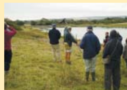
Bird watching walks NT