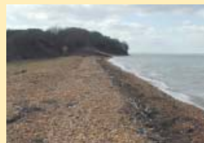
Hamstead Ledge AONB