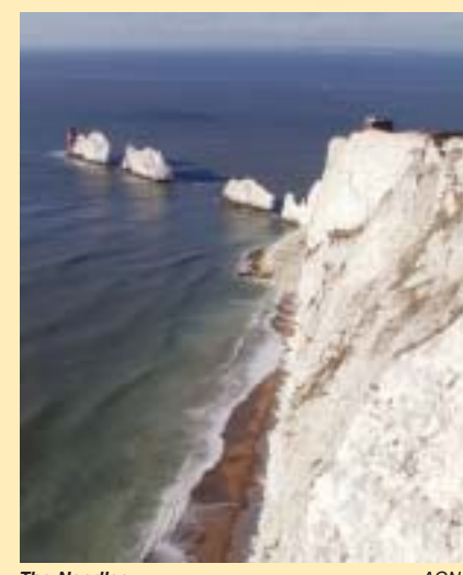
The Needles AONB

● Natural casts of footprints of dinosaurs which lived here 125 million years ago.