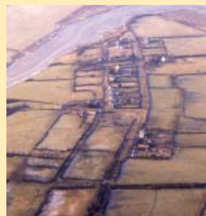
Newtown from the air IWCAHES