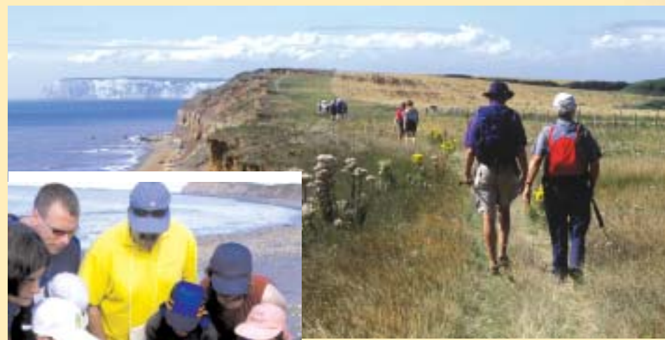
The Coastal Path CA

● From the Palaeolithic (425,000 years ago) to the Bronze Age (4,000 years ago), this Heritage Coast has been used by our prehistoric ancestors who have left huge ceremonial landscapes of burial mounds on the chalk ridge and its downlands. Even the medieval lighthouse at St Catherine's Down was built next to a Bronze Age burial mound. The nearby Medieval Oratory (place of prayer) was built as a place of quiet contemplation of the coastal landscape over 700 years ago.