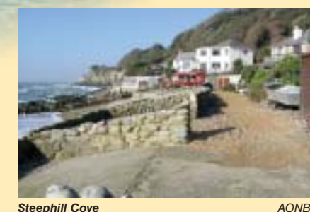
Steephill Cove AONB