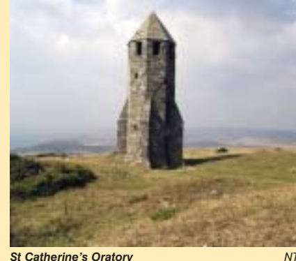
St Catherine's Oratory NT

● Walk through the prehistoric burial landscapes on Afton Down using the Tennyson Trail or visit the Medieval Lighthouse and Oratory for the quiet enjoyment and extensive views of this dramatic coastline.