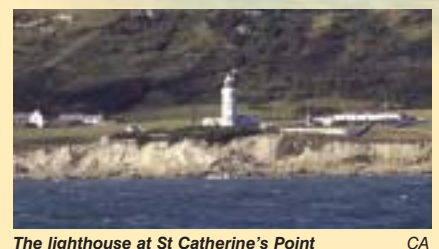
The lighthouse at St Catherine's Point CA