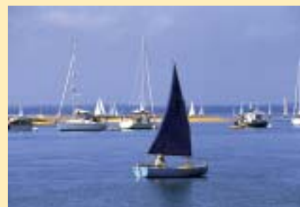
Entrance to Newtown River CA