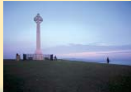
Tennyson Monument CA

● What can we find... Dinosaurs, probably footprints and perhaps ammonites and lobsters further south.