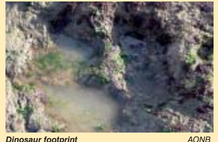
Dinosaur footprint AONB

● Natural casts of footprints of dinosaurs which lived here 125 million years ago.